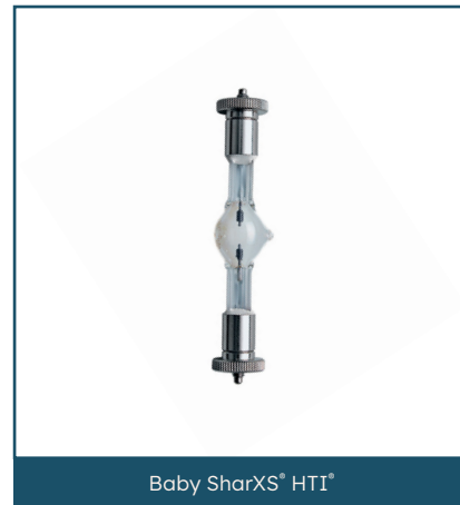
Baby SharXS® HTI®