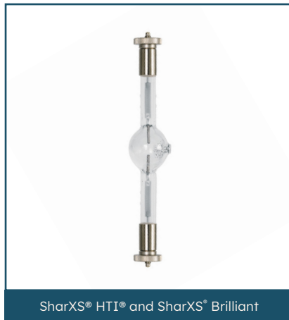
SharXS® HTI® and SharXS® Brilliant