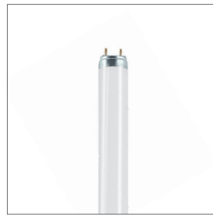
LINEAR BLUE UVA