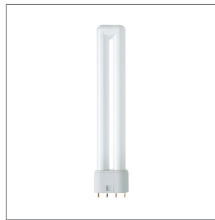
DULUX® L BLUE UVA