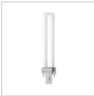
DULUX® S BLUE UVA